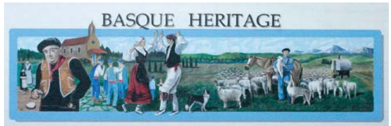
Artist Tom "Zak" Zackery's Basque Heritage mural can be found on the Bob's Auto Glass building in the Wool Growers parking lot.